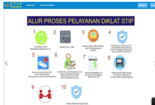
Figure 3. Education and Training Information System

There is a registration menu for prospective participants who do not have an account yet to register online in the Seafarers' Training System portal.