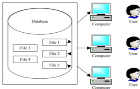
Figure 2. Database System (DBMS)

Physical database management is not carried out by the user directly but handled by special software (system). This software (DBMS) will determine how organizational data is stored, edited, processed, deleted, and retrieved. He also implements a mechanism for securing data for data users together, enforcing data accuracy/consistency, and so on.