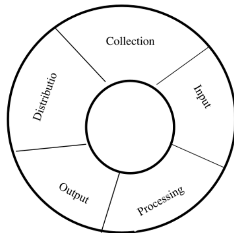
Figure 1. The Information Cycle